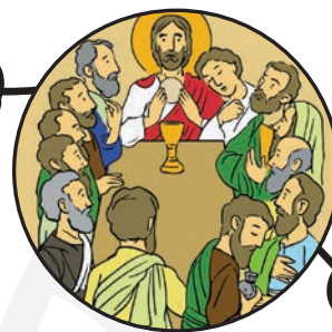
5. THE INSTITUTION OF THE EUCHARIST