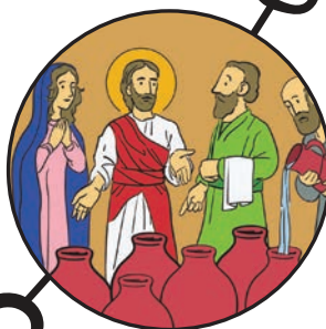
2. THE WEDDING AT CANA