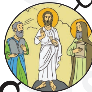
4. THE TRANSFIGURATION